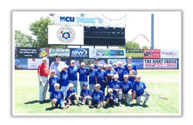
IABF's inaugural youth baseball clinic in 2018 at MCU Park in Brooklyn, New York. .