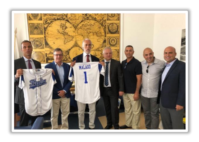
Our 2018 IABF meeting with the Italian Olympic Committee's president Giovanni Malagò.